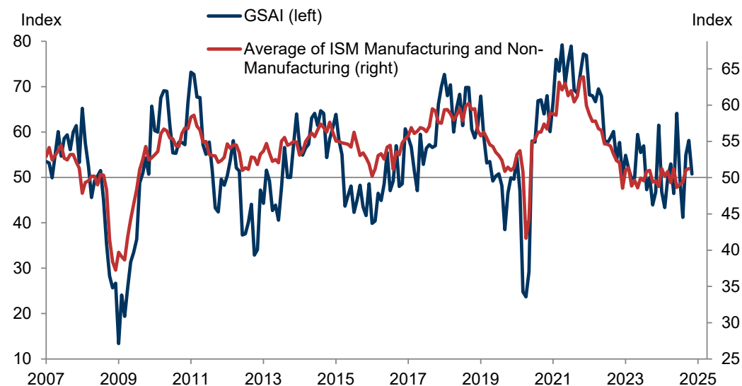
Exhibit 1: GSAI Declined But Remained in Expansionary Territory in November